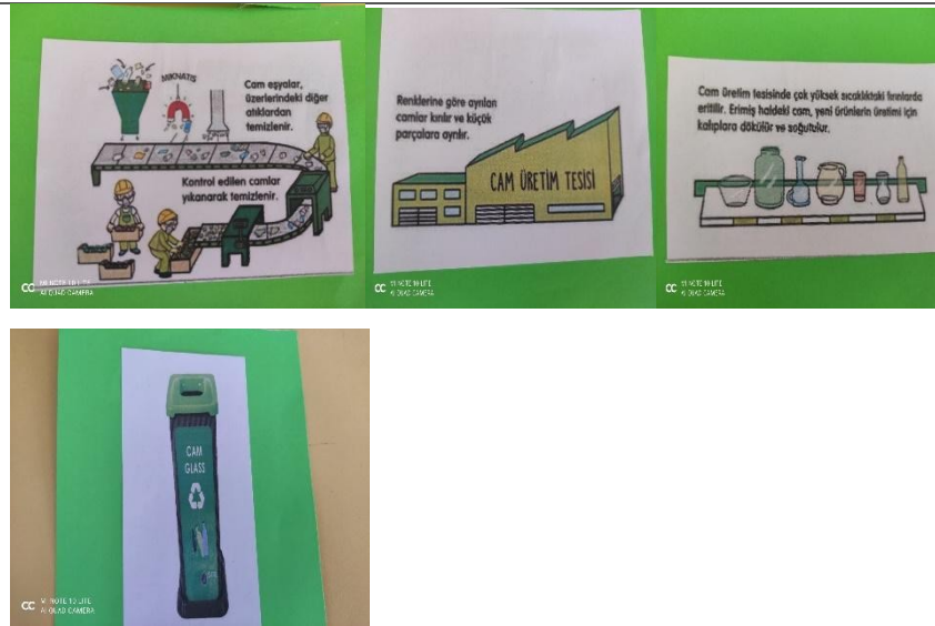
Glass recycling stages